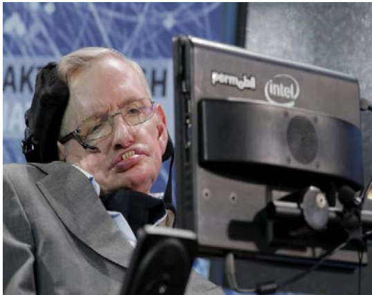
Fig 1. Swift key technique used by Scientist Dr. Stephen Hawking

The swift key technique used in order to communicate by Scientist is shown in figure 1. According to this, the wheel chair is attached with a screen which displays A to Z alphabets one after the other in order. Letters will pop out in alphabetical order. When the appropriate letter comes on screen he used to freeze that letter by tweaking his cheek. Once the starting letter is freezed, using word prediction software the words starting from the freezed letter appears. So again by doing the above procedure words are freezed to form a sentence. This system costs too much i.e., around 2 million USD. Hence, it is unaffordable to common people.